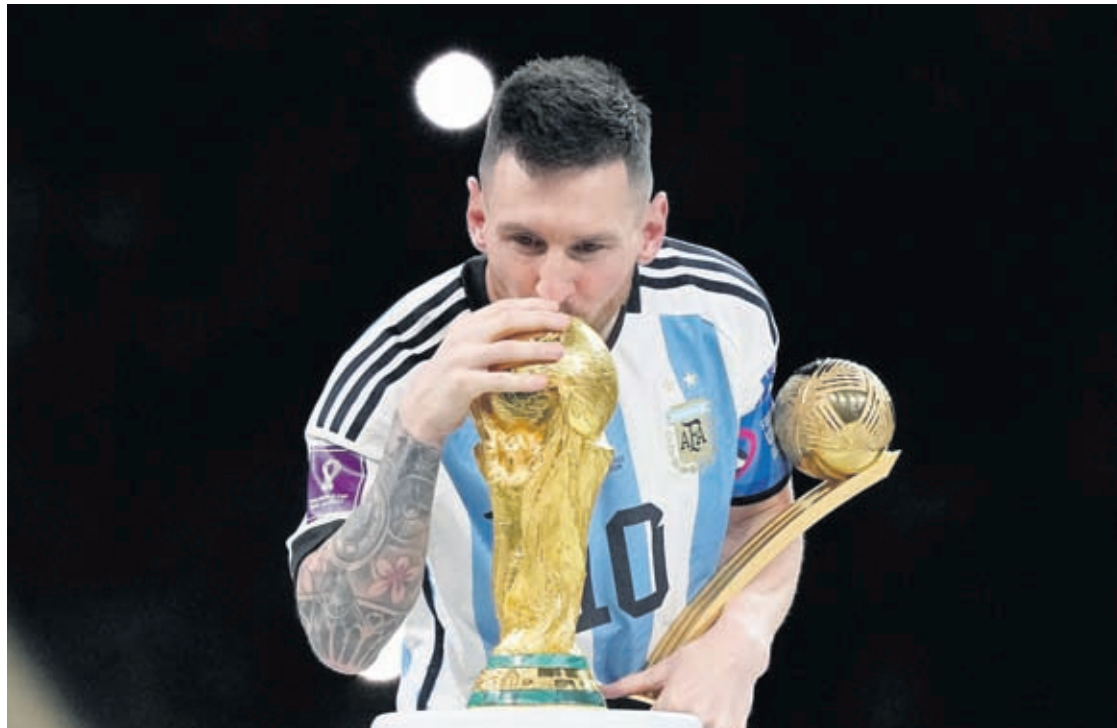
Argentina's Lionel Messi kisses the trophy after winning the World Cup final soccer match between Argentina and France at the Lusail Stadium in Lusail, Qatar, Sunday, Dec. 18, 2022. Argentina won 4-2 in a penalty shootout after the match ended tied 3-3.